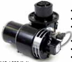
115 / 230 Volt