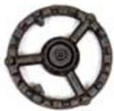
Gas Burner Ring

The standard for gas-fired pressure washers. Impinged jet burner rings offer the most efficient utilization of gas for heating water.