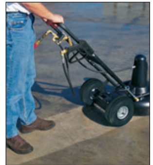
The Water Jet attaches to a hot or cold water pressure washer and cleans flat surfaces fast using a water-propelled spray bar that spins at 2000 RPM