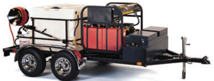
TR-6000 double-axle trailer shown with optional pressure washer, fuel and tool box, work lamp, chrome fenders and wheels

Landa has two trailer-mounted wash systems for on-site cleaning, a single-axle trailer with 200 gal. water tank and a double-axle model with a 330 gal. tank. These top-quality packages allow you to customize the trailer to your needs by mixing and matching trailer beds, pressure washers and a wide selection of options and accessories.