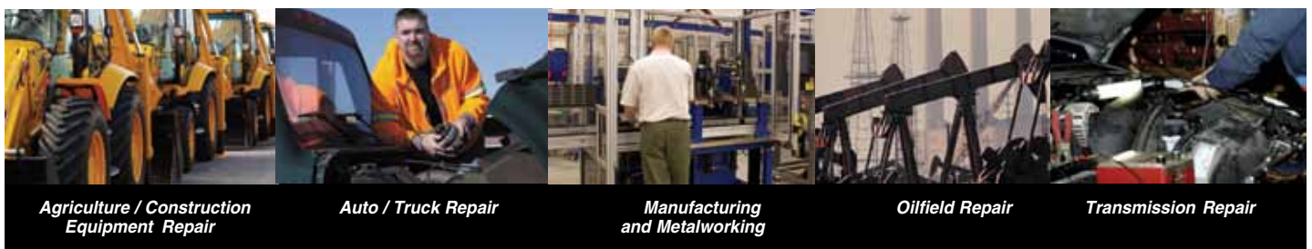
Agriculture / Construction Equipment Repair

Whether the parts you're cleaning are big or small, wide or narrow, heavy or lightweight, Cuda has the automatic parts washer ideal for the job. With load capacities ranging from 500 lbs. to 5,000 lbs., Cuda's top-load and front-load models are the perfect solution for your parts cleaning applications.